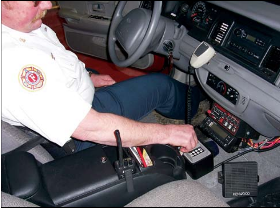
Fire Marshal Byrnes retrieving Knox master key from KeySecure®.

Key Retention Devices into their Knox® Program. All responding vehicles, including the staff cars, have the KeySecure units to ensure the security of the master key. In order to open a Knox-Box, an officer first has to have the master key released via their PIN number. All officers have their own unique PIN code. The KeySecure unit tracks all access to the key based upon these PIN codes allowing the department to see when the keys were released and by whom.